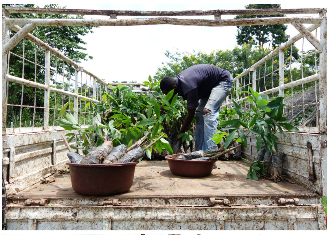
Clockwise from top: Shade trees are prepared for planting, tomatoes from a women-run greenhouse for sale at a local market, winners of the women's soccer tournament.

Training on agroforestry systems, reforestation, forest preservation, and protecting local water sources.