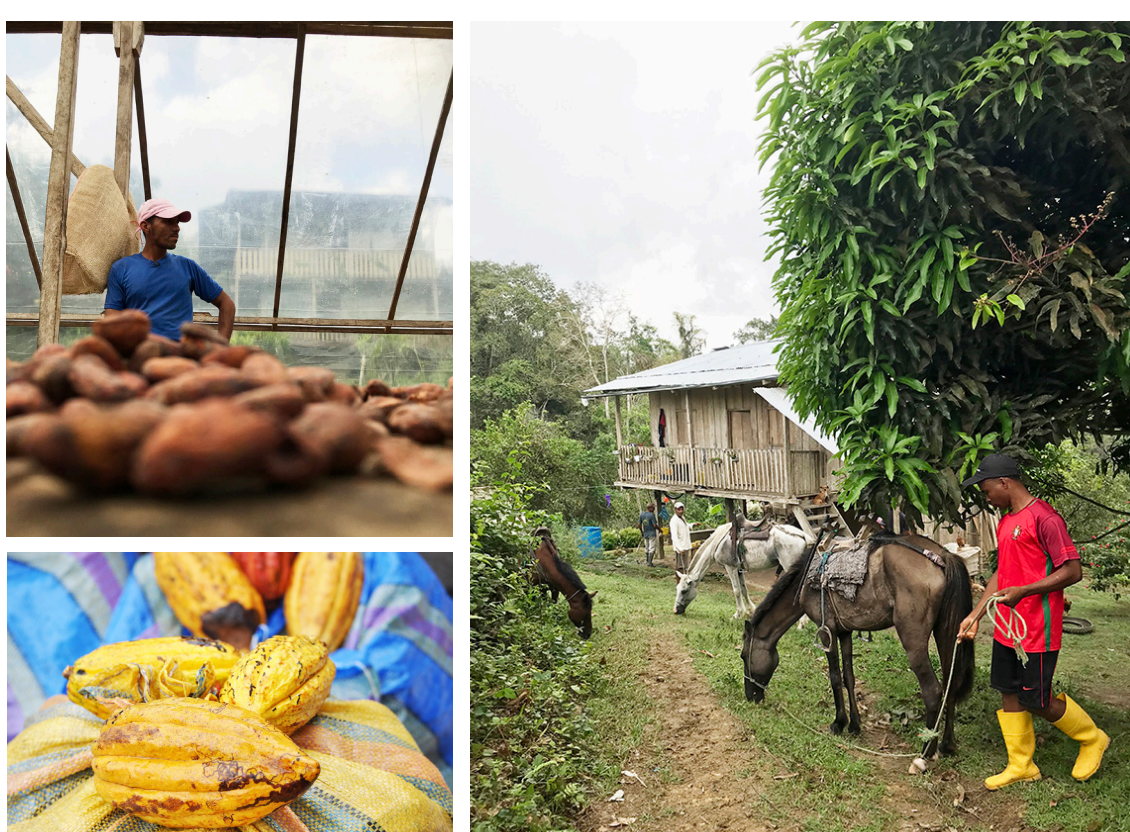
Clockwise from top: A farmer in Ecuador watches over drying cocoa beans, a farm home in Esmeraldas, newly harvested cocoa pods.

Innovative on-farm training for the community-based production of micro-nutrients, natural insecticides and compost help build soil health and protect local water sources.