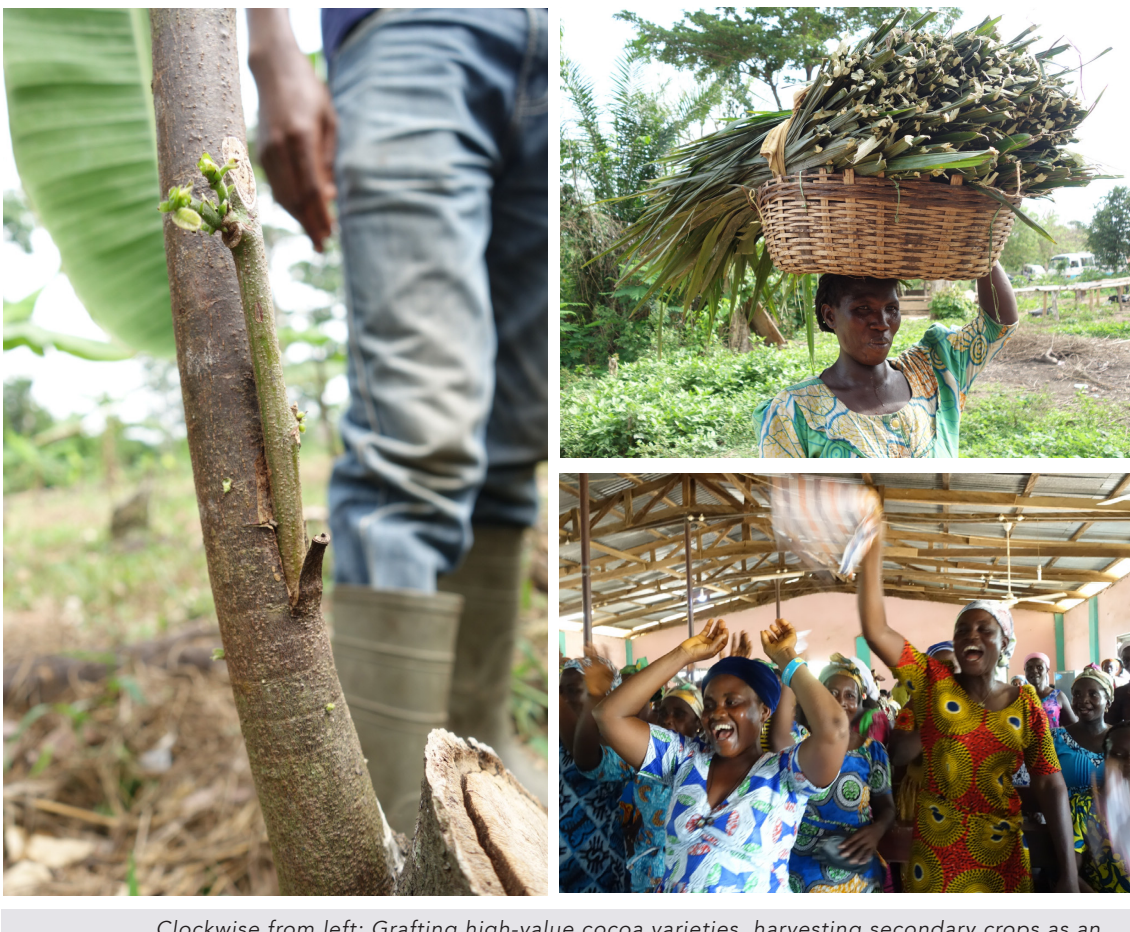
Clockwise from left: Grafting high-value cocoa varieties, harvesting secondary crops as an income source, a program's success relies on the involvement of women in the local communities.

Farmers are planting local timber species for shade and long-term income as well as papaya, cassava, and plantains that provide shade and climate resilience for young cocoa trees while diversifying and increasing family incomes.